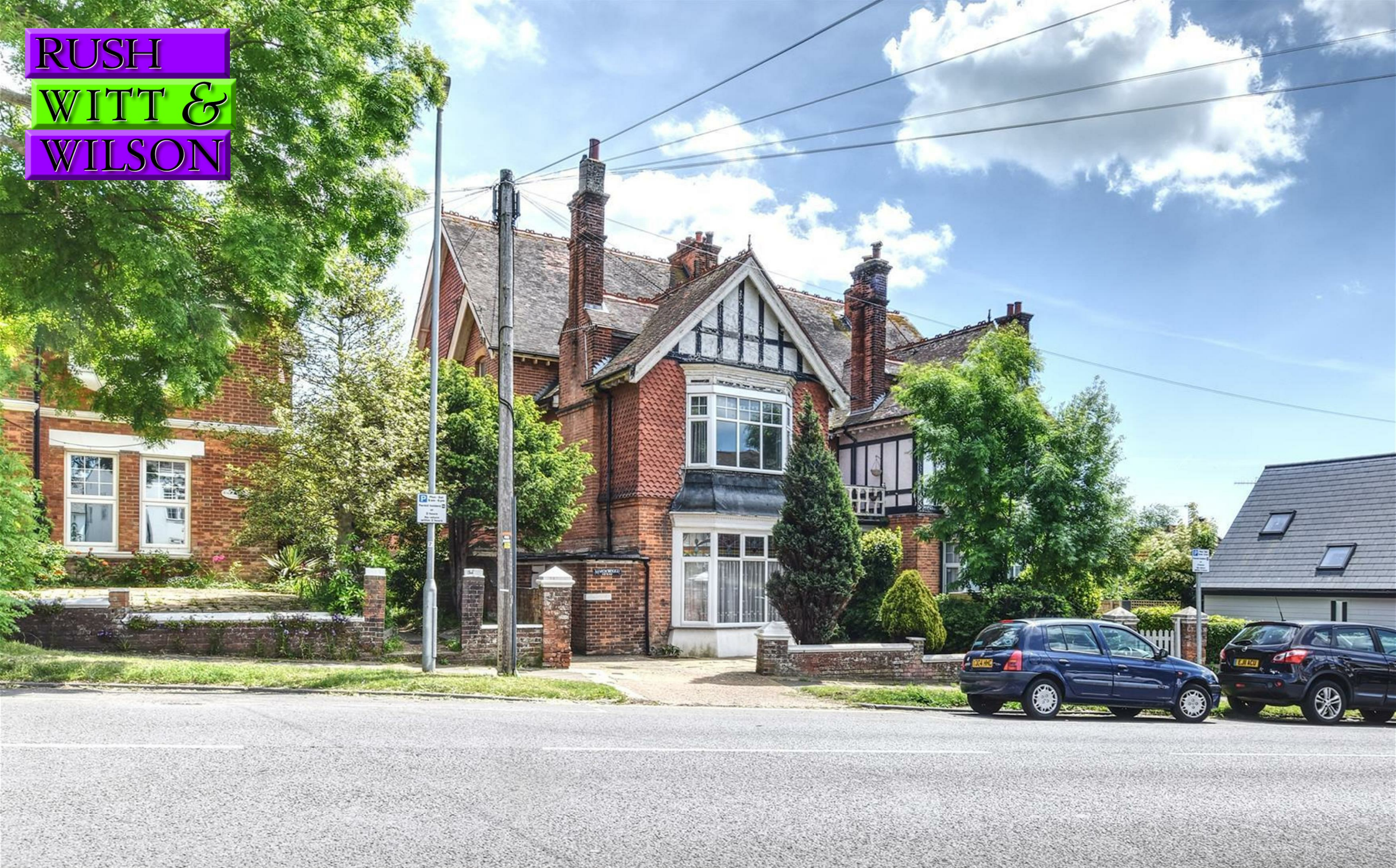
Flat 2 Marlborough Upper Sea Road, Bexhill-On-Sea, East Sussex TN40 1RL £229,000